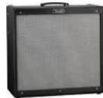
10. ELECTRIC GUITAR